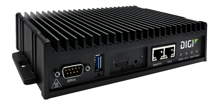
DIGI TX40 5G — FRONT